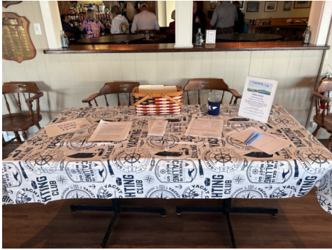
SETTING UP FOR OPEN HOUSE

“AND YOU’LL BE SEATED TO THE LEFT OF THE PRIME MINISTER...”