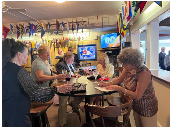
COMMODORE’S BALL COCKTAILS ON THE PATIO