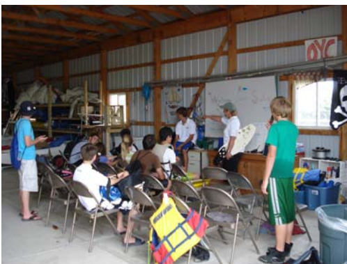
JUNIORS FILING IN FOR DAY ONE OF JULY SESSION